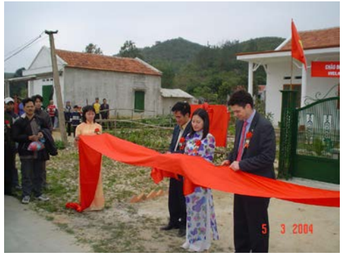
Figure 8: British Embassy representative cutting the ribbon