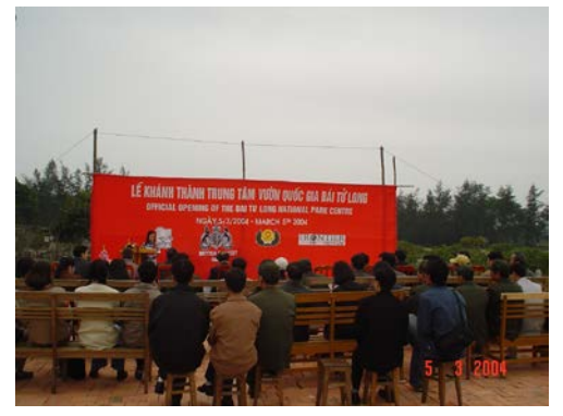
Figure 7: Opening meeting

The Biodiversity interpretation centre was officially opened 5<sup>th</sup> March 2004, with representatives of the National Park Authority, Ministry of Agriculture and Rural Development, Forest Protection Department, the British Embassy, Frontier-Vietnam and community members.