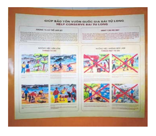
Figure 5: Centre display: wildlife trade