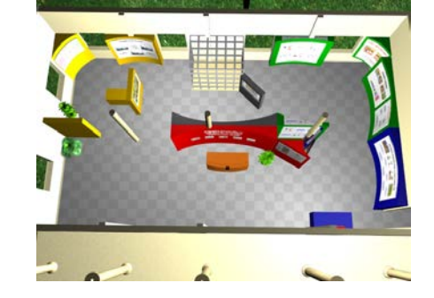
Figure 3: Virtual centre plan